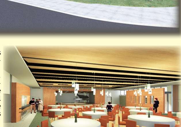
All graphics showing the future Turner Center are renderings according to the current plans by our Architects: g:o Architecture