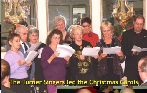
The Turner Singers led the Christmas Carols