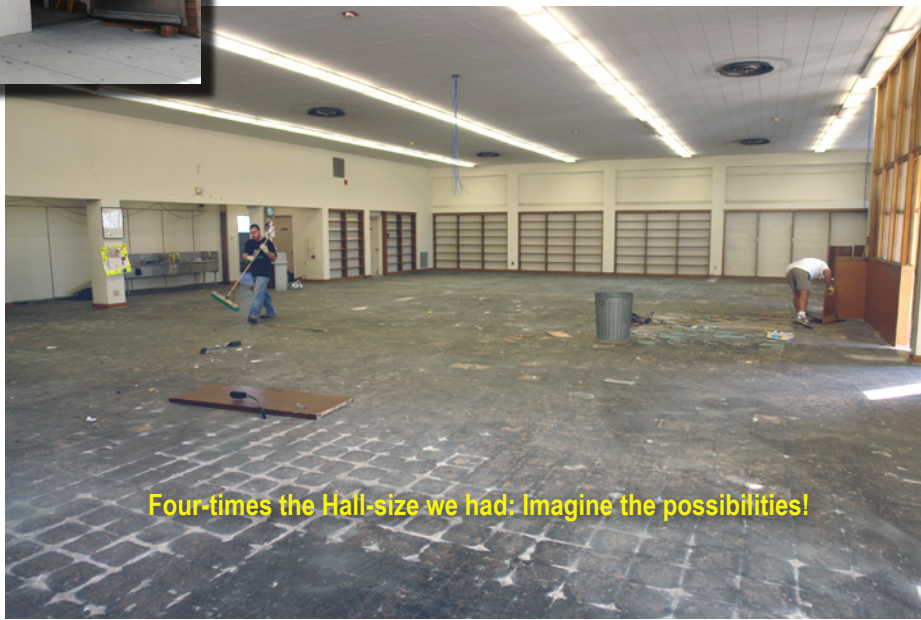
Four-times the Hall-size we had: Imagine the possibilities!

The Zoning process affects mostly the rental of our facilities to outsiders. Seminars, weddings and other occasions when we collect rent for the Center and Services to replenish our funds require a commercial Zoning and the house has to comply to this task. That is the reason why we have to wait for the final OK from the City.