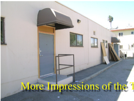
More Impressions of the Turner Center in Remodeling