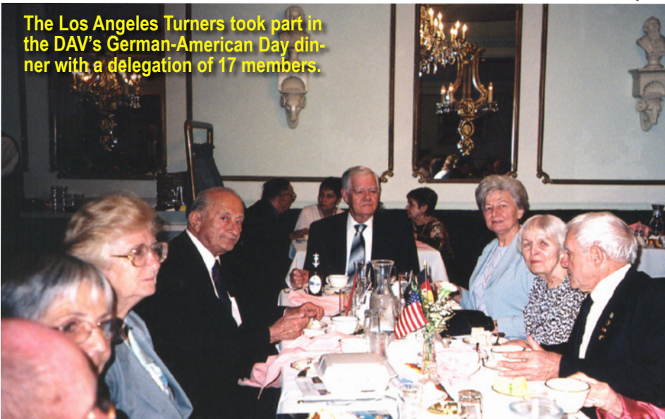
The Los Angeles Turners took part in the DAV's German-American Day dinner with a delegation of 17 members.