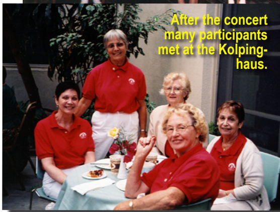
After the concert many participants met at the Kolpinghaus.