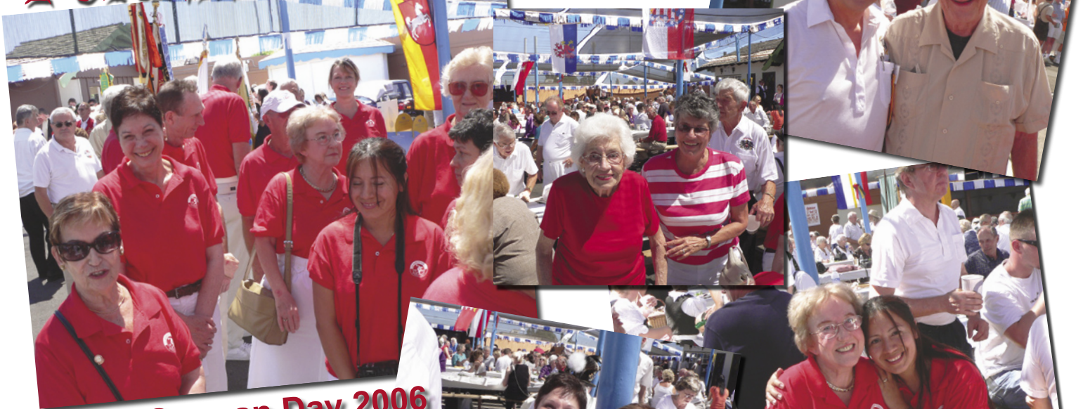
German Day 2006