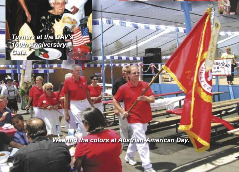
Wearing the colors at Austrian-American Day.

Please direct Correspondence To: Los Angeles Turners, Inc. 8946 Sepulveda Eastway Los Angeles, CA 90045 Website: www.LATurners.com Email: Turners@ahamg.com