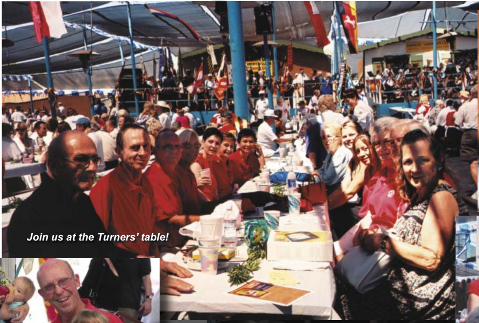
Join us at the Turners' table!