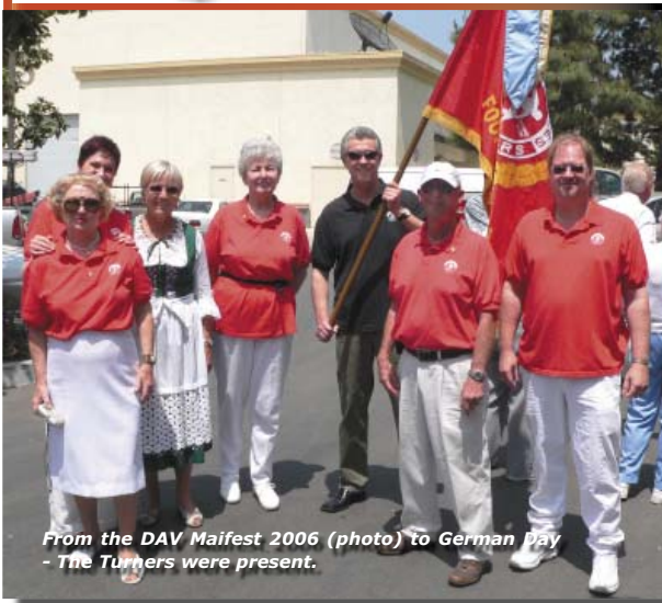
From the DAV Maifest 2006 (photo) to German Day - The Turners were present.