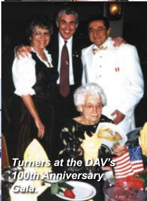
Turners at the DAV's 100th Anniversary Gala.