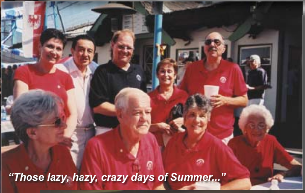
"Those lazy, hazy, crazy days of Summer..."